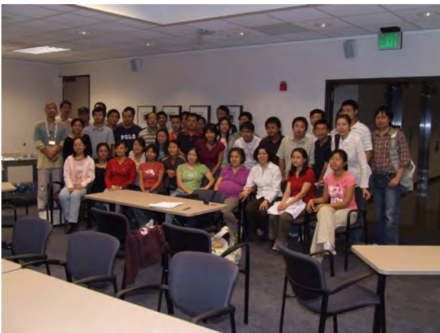
Distribution of donations to students and postdoctoral fellows

phase of hurricane assistance has been very successful. Currently, all victims have found apartments to live and all have basic needs. This will not be possible without help from SCBA.