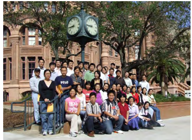
Road to recovery with happy faces again

phase of hurricane assistance has been very successful. Currently, all victims have found apartments to live and all have basic needs. This will not be possible without help from SCBA.